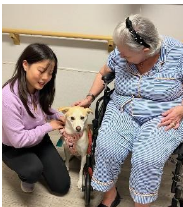
Greenridge Senior care El Sobrante