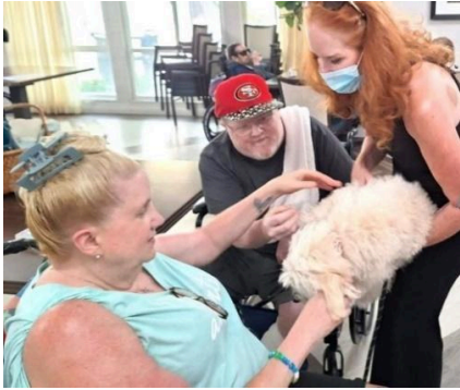
Bayberry Health Care in Concord

LITA of Contra Costa pays for a subscription to volunteermatch.org, where only eligible non-profits can post opportunities. That excludes for profit post-acute care facilities, so based on activity director requests LITA acts like a booking agent for volunteer visitors, at facility venues, the most popular of which are Pet Visitors.