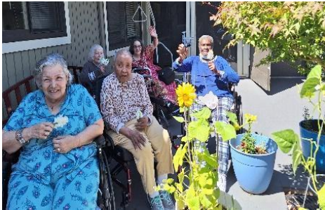
Greenridge Senior Care in El Sobrante Resident Gardeners

A Non-Profit Public Charity since 1980, LITA's Mission is to improve quality of life for senior & disabled persons supporting creative volunteer programs in nursing care facilities in Contra Costa County to help alleviate the loneliness and isolation of fragile senior residents.