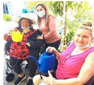
Bayberry HC Gardeners