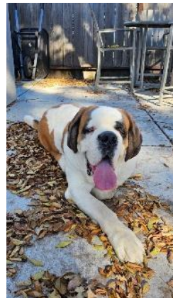
Kobe:Pleasant Hill PAC