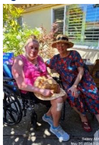
Bayberry Health Care