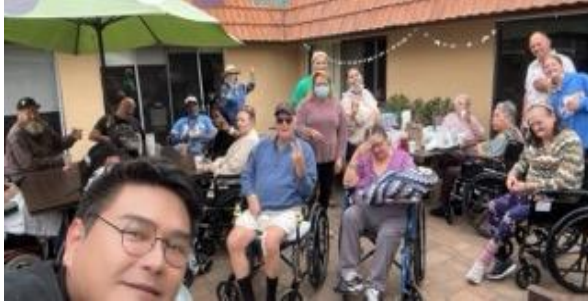
Earth Day Patio Garden Party at Tampico Health Care

A Non-Profit Public Charity since 1980, serving elderly and disabled in care facilities