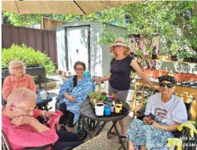
Pleasant Hill Post Acute Care

Tampico Health Care in Walnut Creek, Pleasant Hill Post Acute Care, Bayberry Skilled Nursing and HealthCare in Concord, Pittsburg Skilled Nursing and Greenridge Senior Care in El Sobrante. They would all welcome an enthusiastic local gardener to come help out, on a regular basis or scheduled as a special patio garden event. Let's talk about it! .