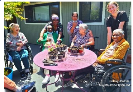
Greenridge Senior Care