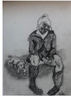
Woman with Dog