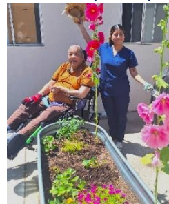
Pittsburg Skilled Nursing