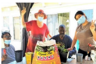
Garden group at Pittsburg Skilled Nursing