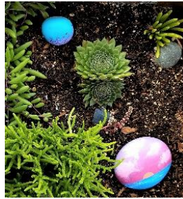
Succulents & fun rocks