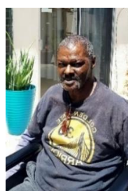
Go Warriors !